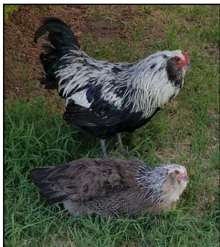
The "Love Birds."

Our club continues to maintain good numbers. The Alliance has added 15 new members this quarter. We appreciate the continued support of all members, especially during this pandemic, when so many shows have been cancelled. I have been taking advantage of being stuck at home by raising lots of growouts. I chose to focus on silvers this year, and I am raising cohorts from several different cocks over my outcross hens and I am getting some nicely marked chicks (and even more not so nicely marked chicks, haha). Sadly, space has required something to give and I will have to scale my blacks back to a single trio. I remain optimistic that I can produce a good bunch of nice LF silvers this year. I have a pair of silvers hatched last fall that are the funniest birds. I call them my love birds. They hop the fence and hang out together in our front yard. They are inseparable and mate constantly. I've never seen two birds so closely bonded.