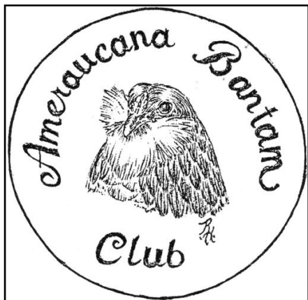
Original Ameraucana Bantam Club Logo

Article 6 of our constitution/bylaws covers Election of Officers and this is an election year. "Candidates must notify the President by October 1st of their candidacy" and I've notified myself that I'll run again for president. Consider tossing your hat in the ring for president or director. I'll appoint an Election Commissioner and Assistant by mid-August.