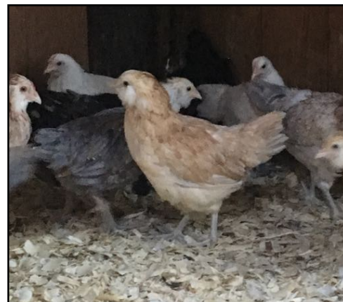
Jeff's large fowl Blue Wheaten growouts in with Bantam Langshan.

Raising chickens is good therapy for people's physical and emotional health. It is great we have a hobby that is also good for us. My chicks are growing well. I especially enjoy watching our bantam Wheaten and large fowl Blue Wheaten (chicks are actually Wheaten, Blue Wheaten and Splash Wheaten) develop. This is my first time raising LF Wheaten/ Blue Wheaten Ameraucana. They are such good-looking varieties in my opinion. I am looking forward to sorting through the young from this LF Blue Wheaten mating. This makes it a bit more exciting to save back the keepers for the next breeders. I look forward to them becoming the beginning of generations to come.