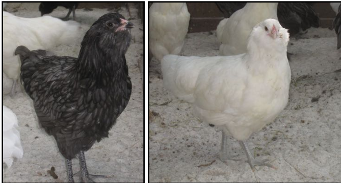
Some of Stan's favorite birds this spring.

So hopefully this fall we will begin getting back to the 'new normal' and that means fall poultry shows! I hope to get out to a few and see some old friends and make some new ones! I'm still working to get consistent color back into the White chicks. By being very selective, I hope to eliminate the yellow chicks and get back to consistently getting the light Grey chicks, that will produce the better colored Whites.